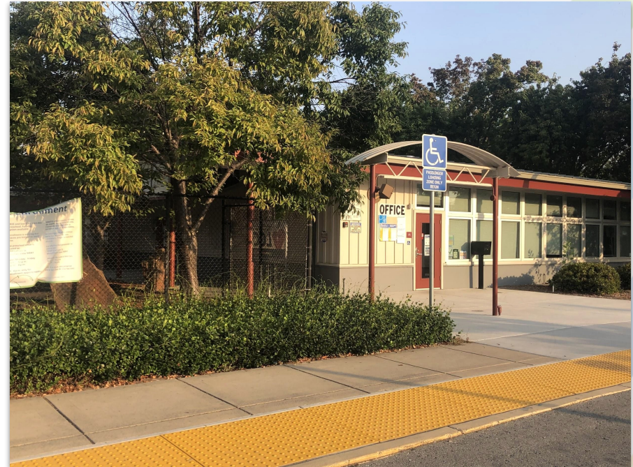
Mountain View Whisman School District