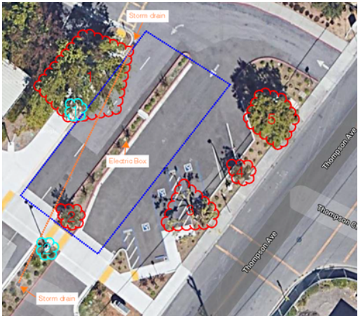
Office in front of school. Red circles show trees to be removed for solar panel construction.