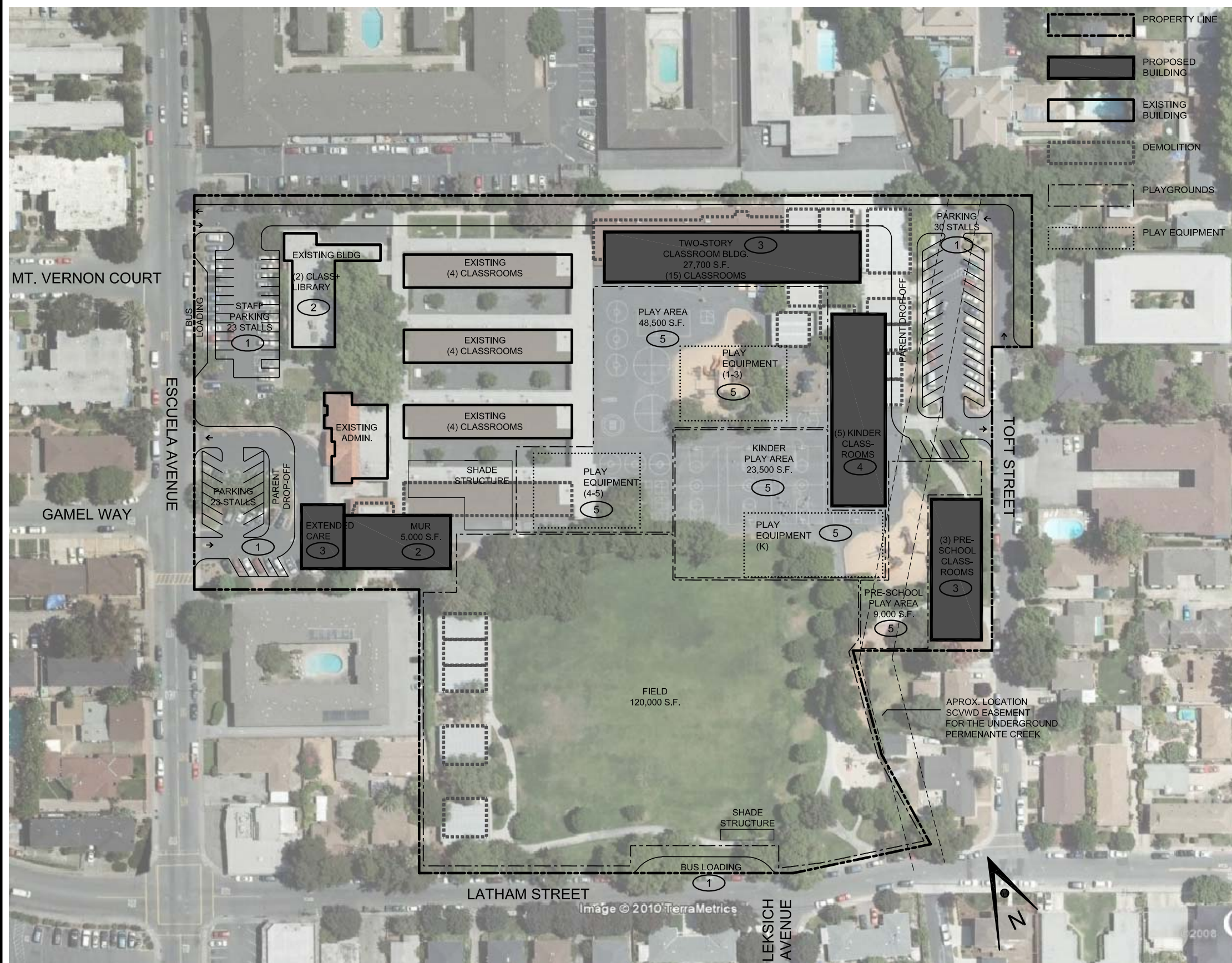
PROPOSED SCENARIO 1- SINGLE CAMPUS